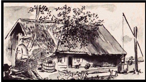
Deutsches Bauernhaus in der Weichselniederung Jahrbuch Weichsel-Warthe 1990

HSGPV is a Canadian non-profit society dedicated to preserving and promoting the historical and cultural heritage of Germans from Poland & Volhynia.